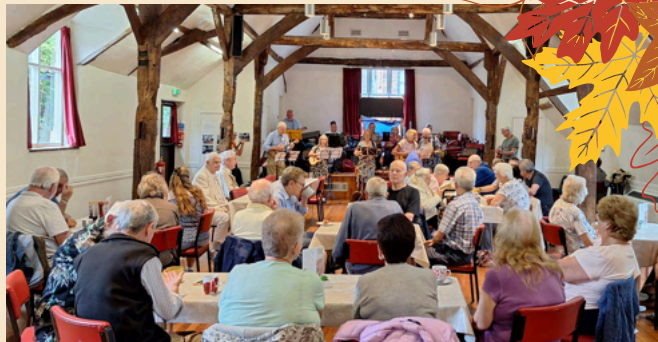
Loose Chippings at Top right - Church Cottage Bottom Right Hill Rise Hall

As always our Community Cafés and The Tadley Social Group are extremely busy. Regular activities such as Loose Chippings, a local Ukulele band (pictured right), “new age kurling” and birthday bashes, keep people coming back. Thanks as always to the support of the volunteer teams at each venue.