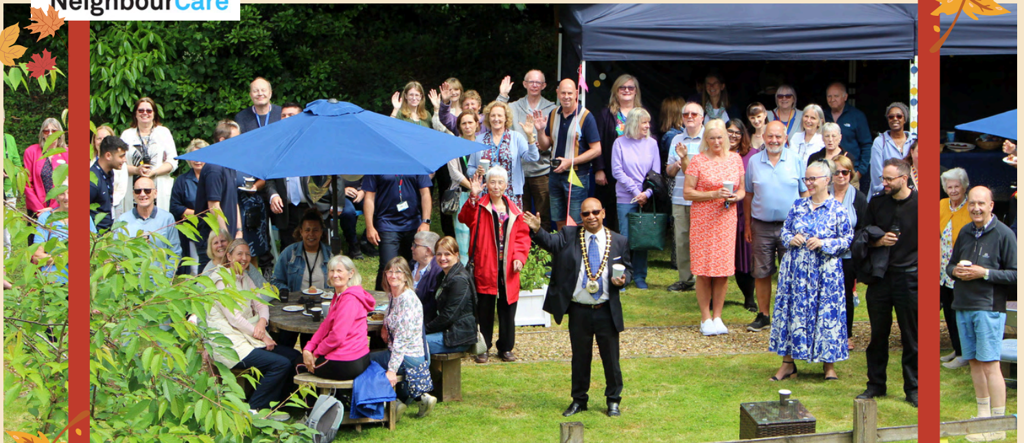
BVA VOLUNTEER TEA PARTY 6TH JUNE 2024