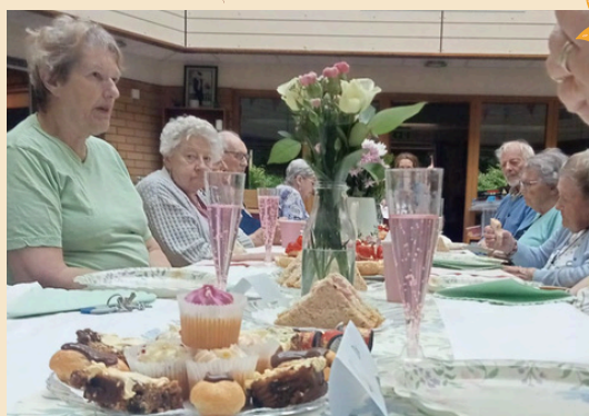
Left - Birthday celebrations at The Tadley Social Group