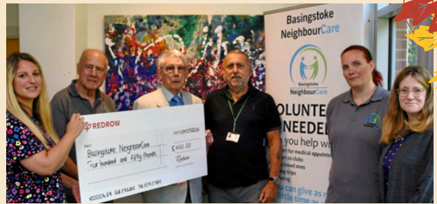
Above - A donation received from Redrow